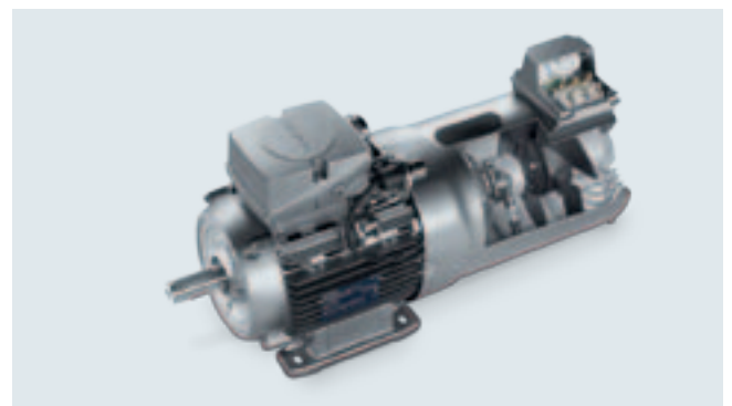
Encoders, brakes and external fans can be easily added.